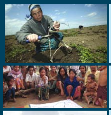
WFP (Central and East Africa; Asia; Latin America and Caribbean)

Table 2.1 Good Practice Examples Shared by IASC Agencies