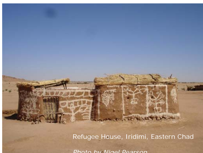
Refugee House, Iridimi, Eastern Chad