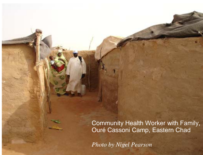
Community Health Worker with Family, Ouré Cassoni Camp, Eastern Chad