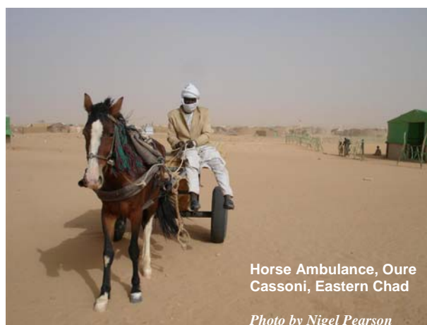
Horse Ambulance, Oure Cassoni, Eastern Chad

The referral system for refugees appeared to be adequate, especially in comparison with the national system. The quality of care is poor for Chadians in government hospitals that are not supported by an NGO, and financial access is very limited. Drugs and equipment are in short supply, diagnostic facilities very limited and wards run on skeletal staffing (see Chapter II.4 - The local health system). Wards have only one nurse, and some district hospitals have only one nurse covering for 18 hours of the 24 hour period. Safe blood transfusion is not universally ensured and in regional hospitals there is no facility for looking after trauma patients and no tertiary /specialist care except gynaecology, unless when supported by NGOs or faith-based organisations