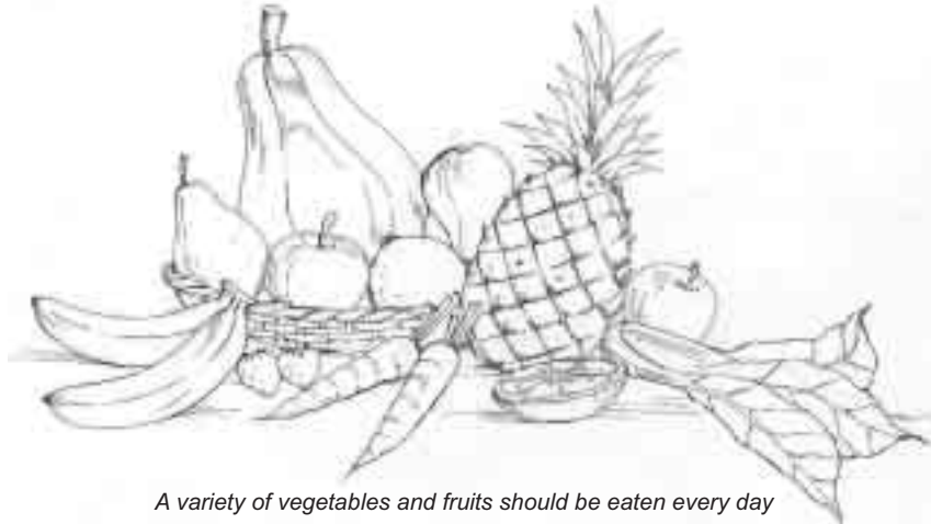
A variety of vegetables and fruits should be eaten every day

Food based sources of vitamins and minerals are the best choice. The use of multivitamins is recommended over the use of taking an individual micronutrient, because excesses of some single micronutrients can be harmful. Multivitamins are not a “ magic bullet ”, in that they should not replace healthful food choices. Fortified/enriched foods, cereals and grains, where available and affordable, are also a good source of some essential vitamins and minerals and can be incorporated as part of a nutritious diet.